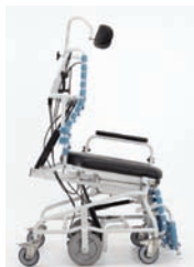
8° Anterior tilt