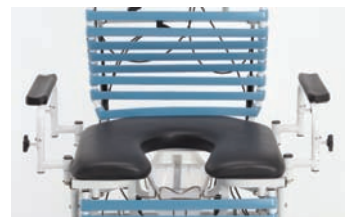
Open front commode seat facilitates peri cleaning

Width adjustable armrests accommodate widths up to 33"