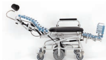
65° Back recline

Width adjustable armrests accommodate widths up to 33"