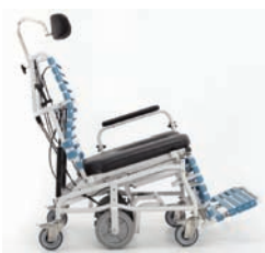
14° Posterior tilt