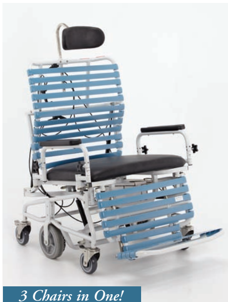
3 Chairs in One!